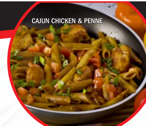
CAJUN CHICKEN & PENNE