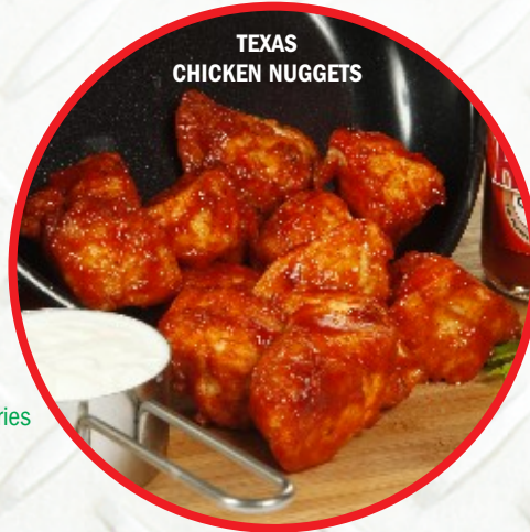
TEXAS CHICKEN NUGGETS

Edamame 120 calories Soy beans, steamed and lightly salted - 3.79