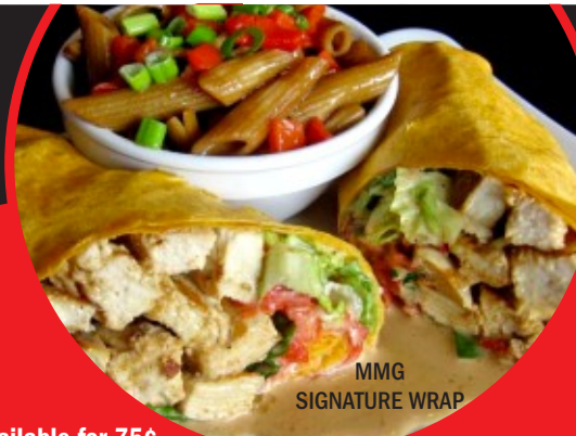
MMG SIGNATURE WRAP